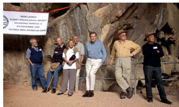
A group of attendees listen to the book launch proceedings in Victoria Arch.

In the meantime, those seated waiting for their turn to be served were entertained by another Power Point Presentation, this time depicting members and friends of SSS, past and present, and which caused many bouts of hilarity from various tables around the tent.